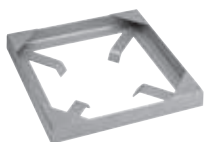
Counterbase to wall up