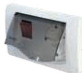
Electronic speed controller R15