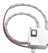
Plug-in junction box