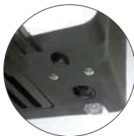
Water tank easily removable from the external side.