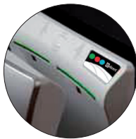
4 air diffusion layers for an ultra-fast drying.