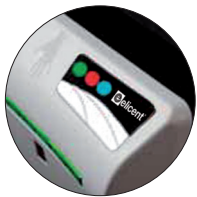
Warning lights for a quick diagnosis of the dryer.